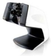
Figure 1. TrueField Analyzer (TFA) is an objective perimeter based on multifocal assessment of both eyes at the same time. This provides direct and consensual responses for each of 44 regions of both visual fields, hence 2*2*44 = 176 responses in 4 minutes (2 min/eye). The response data includes amplitudes, delays, and SE for all 176 responses.

CONCLUSIONS: ON had no significant effect and both RR and PS patients had %AUC consistent with EDSS scores suggesting that the results were more dependent on "secondary" degeneration than inflammation history.